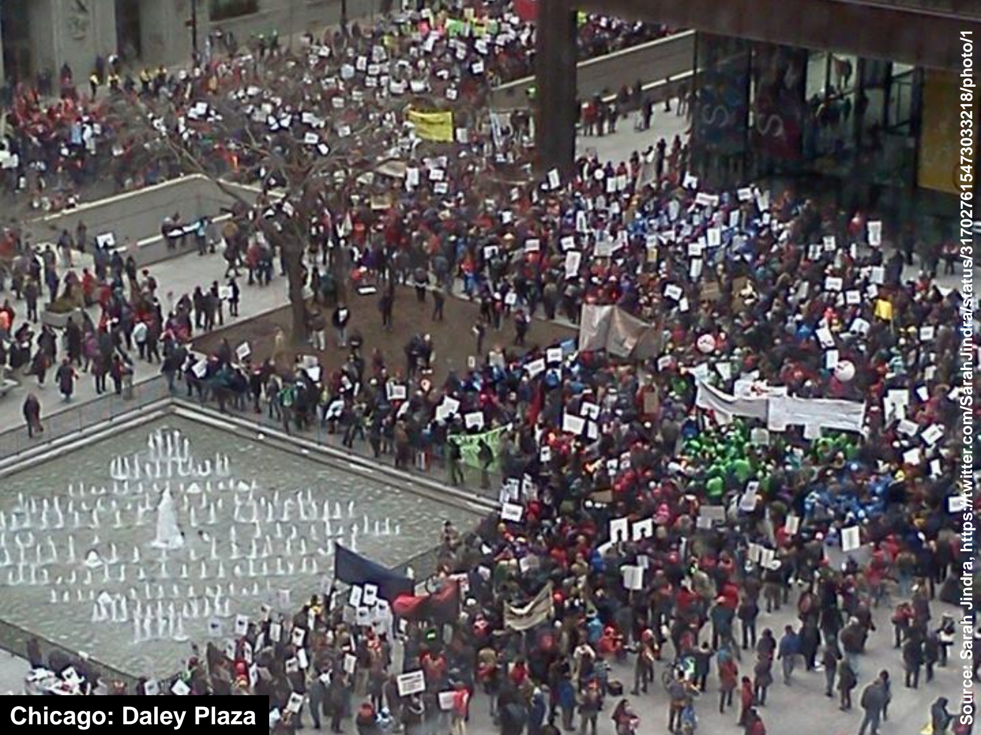
Chicago: Daley Plaza