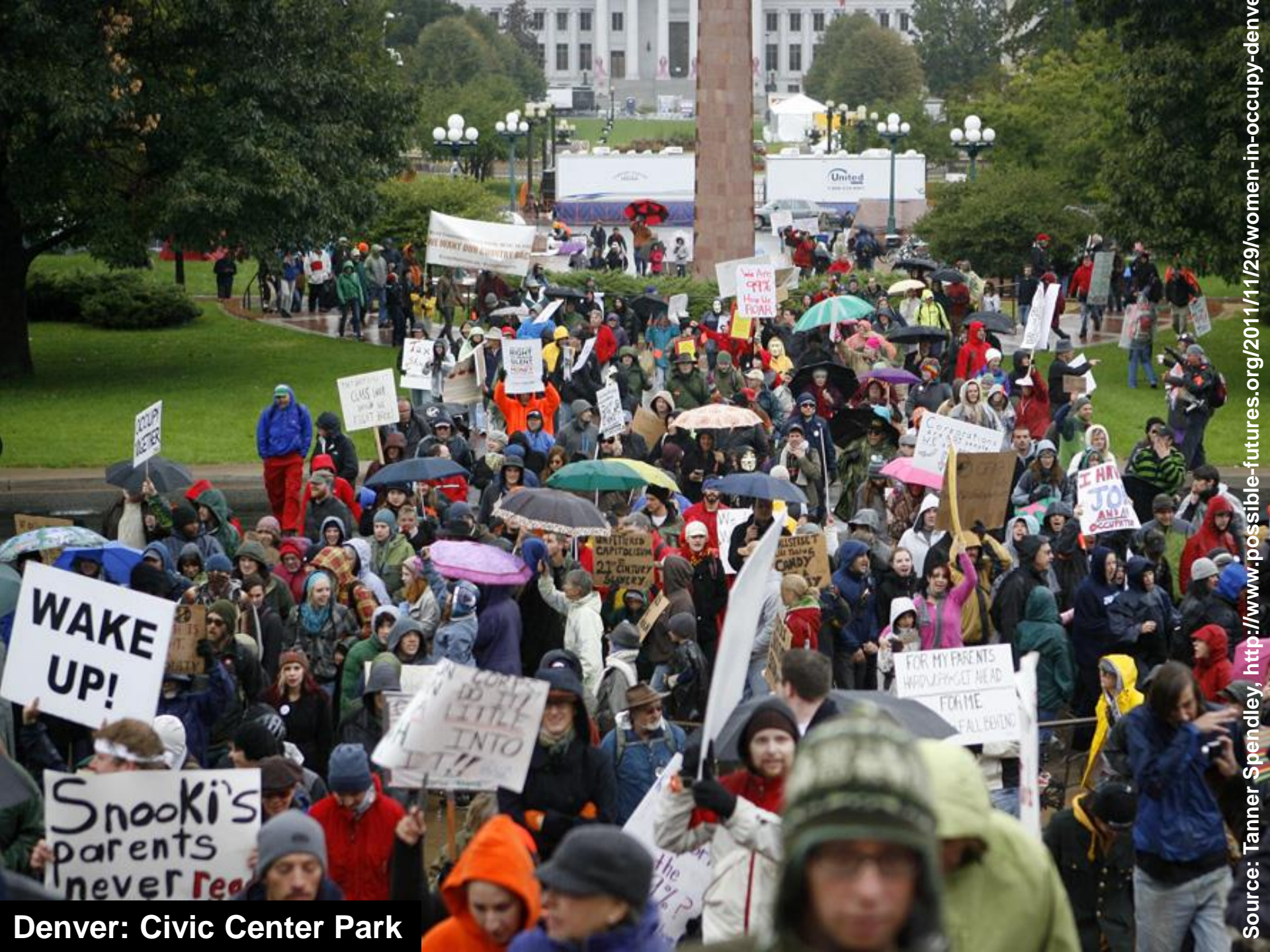
Denver: Civic Center Park