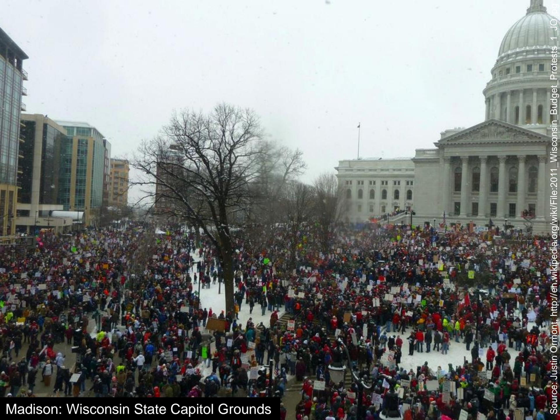
Madison: Wisconsin State Capitol Grounds