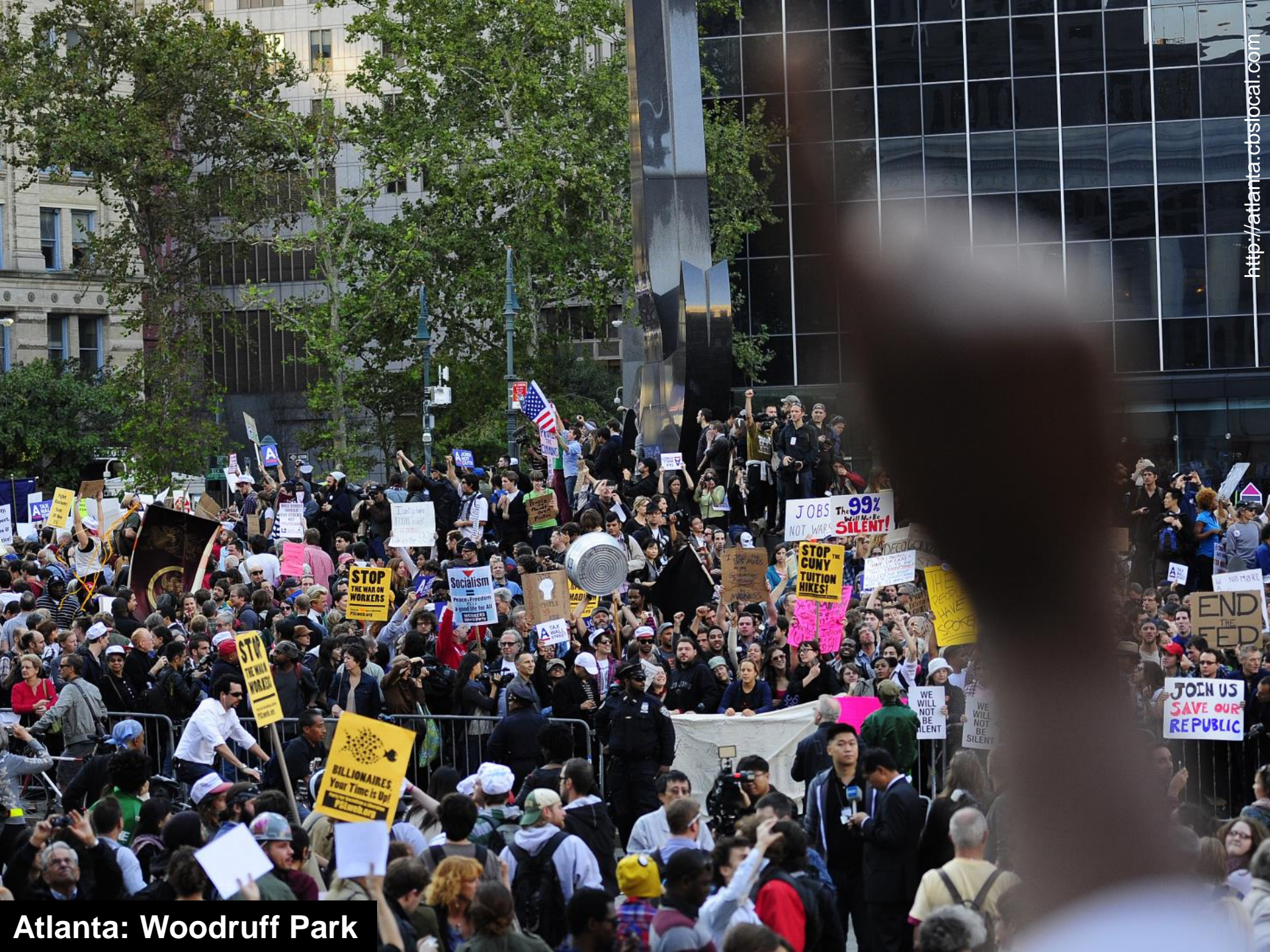
Atlanta: Woodruff Park