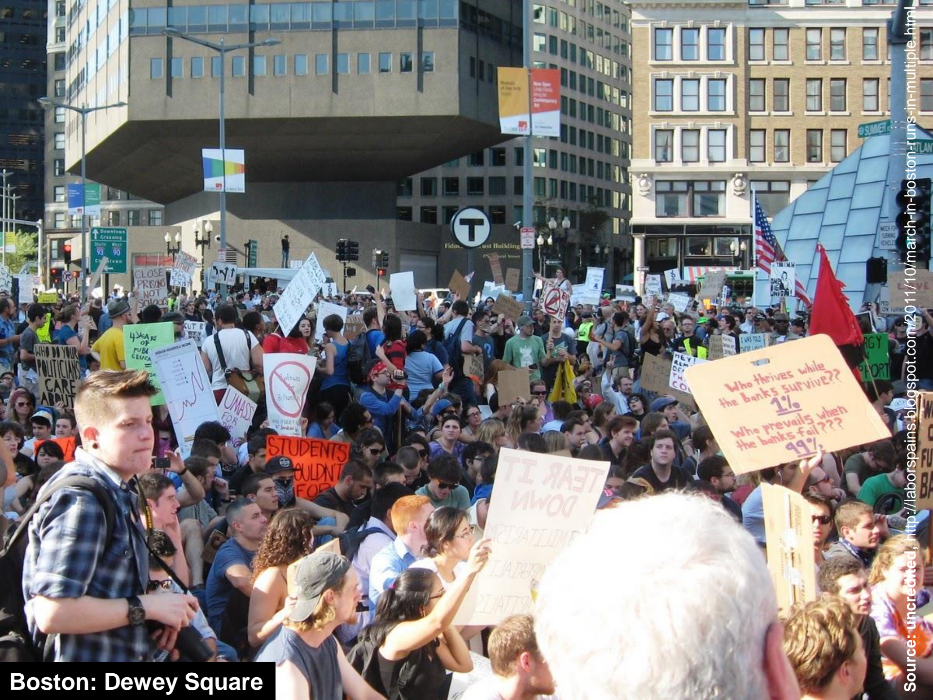
Boston: Dewey Square