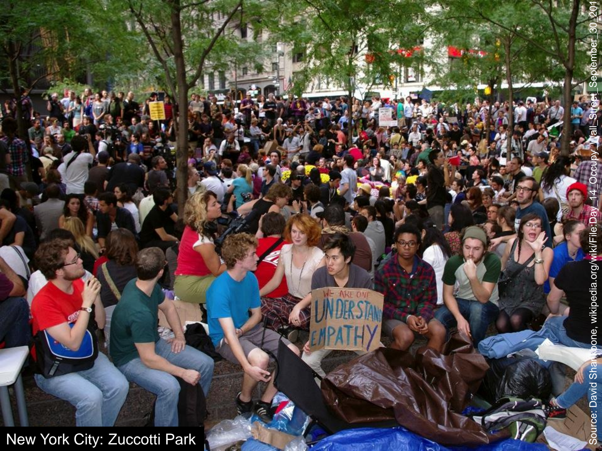
New York City: Zuccotti Park