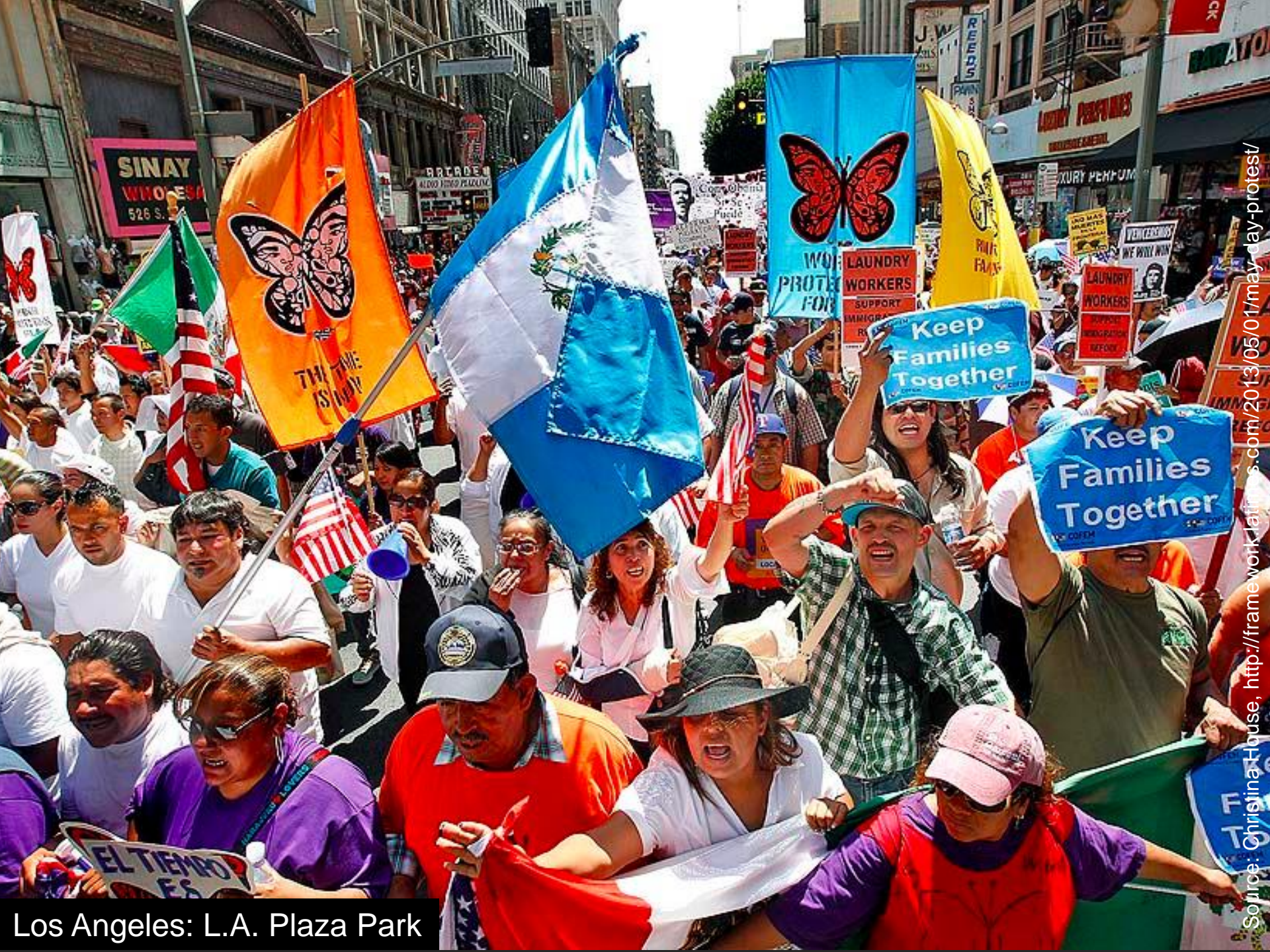
Los Angeles: L.A. Plaza Park