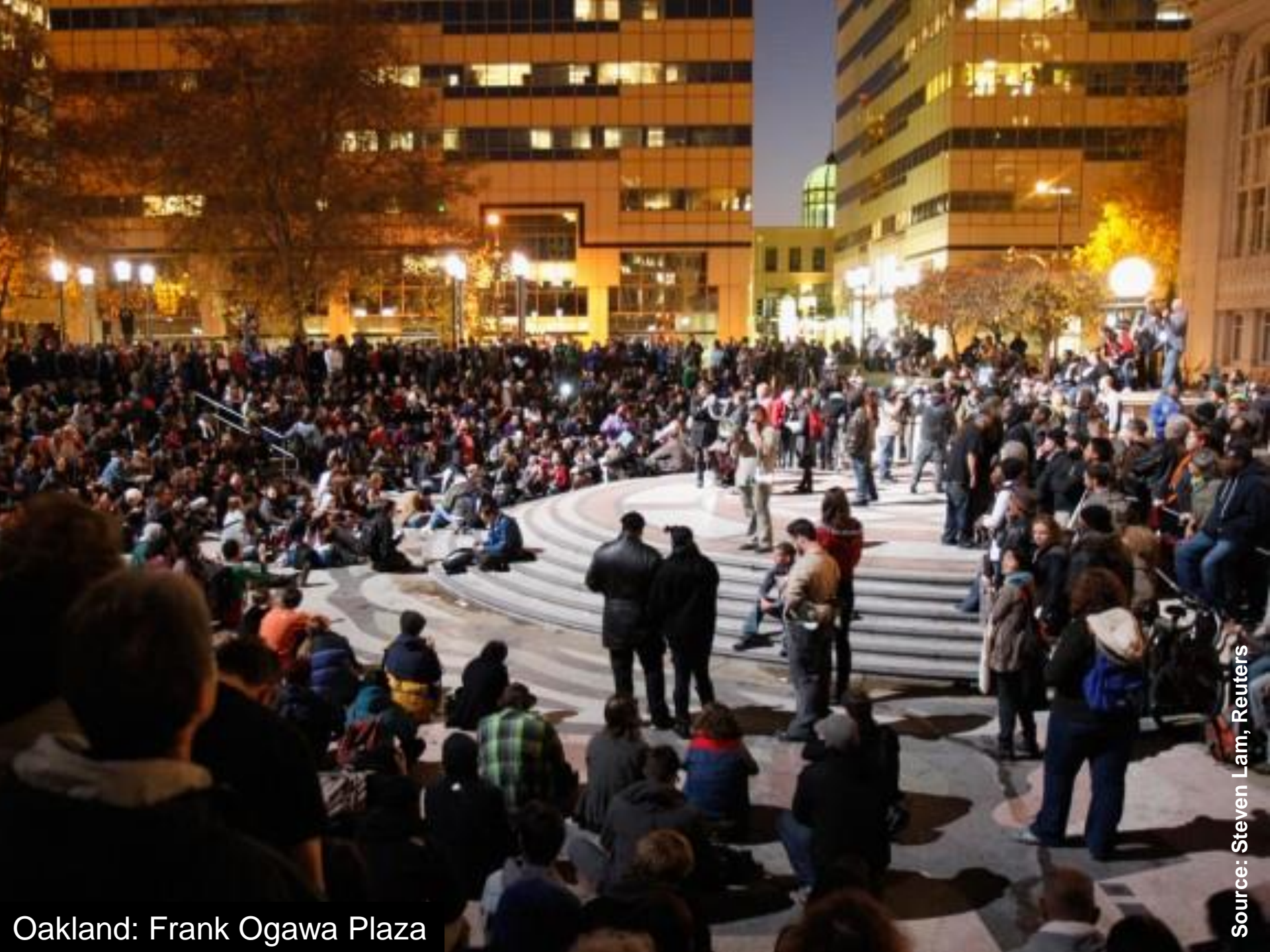
Oakland: Frank Ogawa Plaza