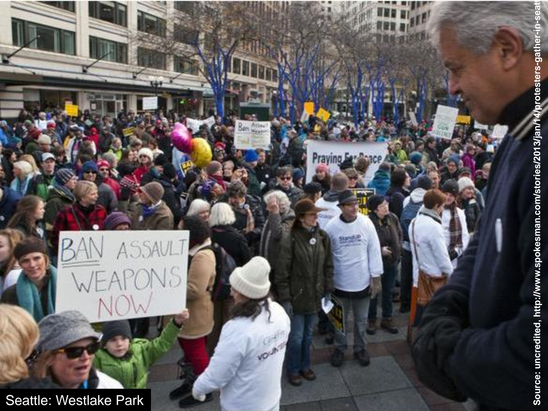
Seattle: Westlake Park